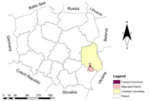
Fig. 1. Map of location of analyzed commune

This paper aims to determine the needs for land consolidation and exchange in the villages of the commune of Frampol, in the Biłgoraj District, in Lubelskie Voivodship (Fig. 1).